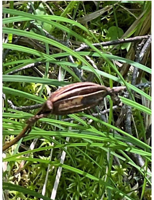
Seed pod detail

Fierce mosquitoes and allegedly numerous ticks (indeed, few hitchhikers had to be expelled from the bus upon checking our cloths) were an unwelcome bonus to our trip. Yet, a very interesting trip and always exciting to see orchids in situ.