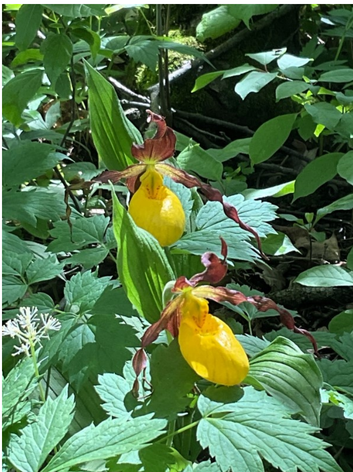
Large Yellow Slipper Cypripedium parviflorum var. pubescens

I am a member of the Orchid Society of Minnesota (OSM), and on June 1 a group of OSM members took a bus trip to Mille Lacs Kathio State Park where the park ranger showed us two magnificent Lady's Slippers in bloom: Large Yellow Lady's Slipper and Pink Lady's Slipper. If you did not know, the state flower of Minnesota is Cypripedium reginae (Showy Lady's Slipper), and overall, according to Minnesota Department of Natural Resources, there are over forty species of orchids (including six Cypripedium species) that are found in the state. Some of them are late spring - early summer bloomers.