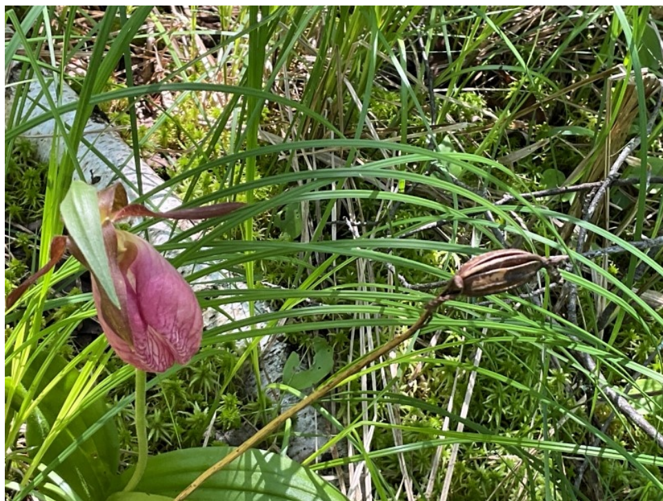
Pink Lady slipper (Moccasin Flower) Cypripedium acaule

Pink Lady Slipper produced a solitary flower with the pouch color ranging from almost white, to rich pink with deeper colored intricate veining. This species of Lady Slippers is considered globally secure and is common throughout much of its range.